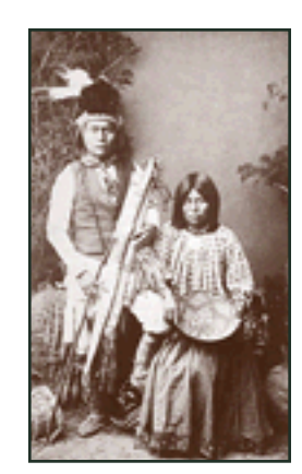
An Apache man and his wife.

Today, there are about 56,000 Apaches. Many live on reservations in New Mexico, Arizona and Oklahoma.