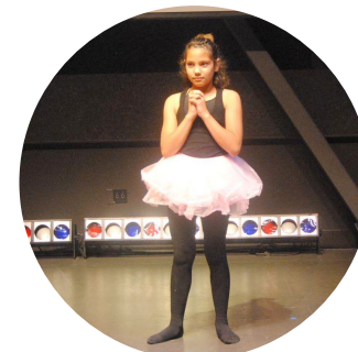
Student performs at our talent show