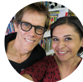
Kevin Bacon visited our learning center