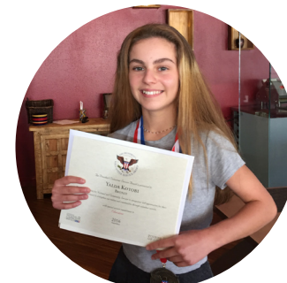
Award winning student tutor