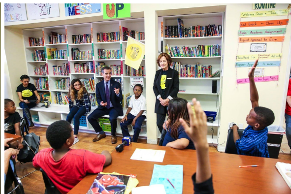
Mayor Garcetti taking questions from the students at the Skid Row Learning Center