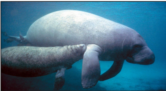
A manatee mother with her calf

It is hard for scientists to know how many West Indian manatees there are. They estimate between 2,000 to 5,000. The West Indian manatee has been listed as an endangered species. This means that the population is so low that the West Indian manatee may become extinct. Many die because of accidents with ships or other human causes, such as pollution. Federal and state laws protect the manatee. Scientists are working to find ways to help the manatee survive.