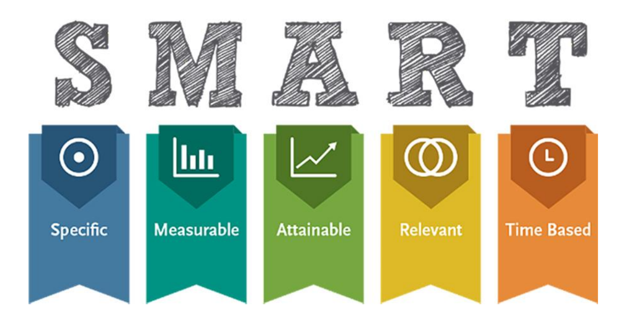
Setting S.M.A.R.T goals in different areas will help fulfill the requirements of your chosen college application.

For example, a S.M.A.R.T. goal for a student who wants to improve their English grade might be, "I will get an A on my next English paper by making sure I