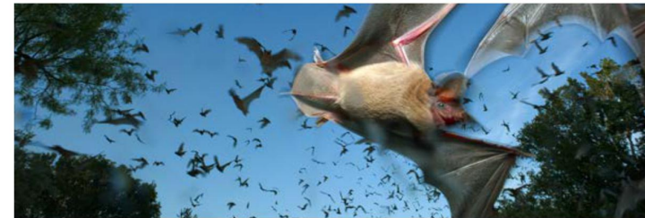
Bats are the only mammals capable of true flight.