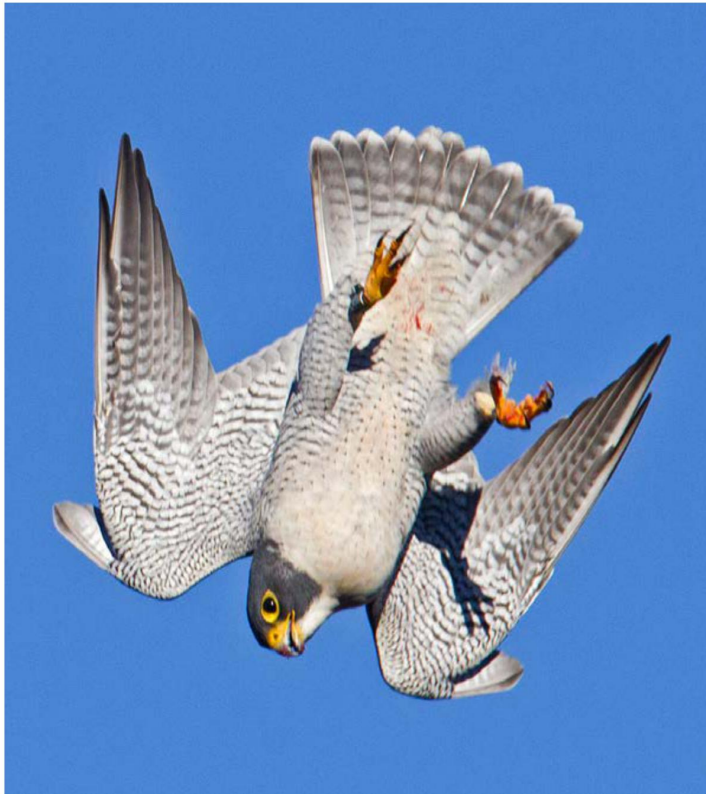
Falcons hunt using sharp eyesight.

The fastest animal on Earth is the peregrine falcon.