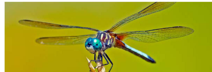
A dragonfly's wings allow it to move sideways, backwards, or just to hover in place.