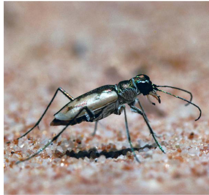
This tiger beetle lives in Australia. It can run so fast that its eyes and brain can't do their jobs. The result? It becomes blind until it stops running.

Small animals are slower than big animals, but some go fast for their size.